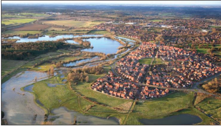
Bowthorpe, river in flood