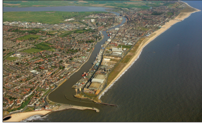
Great Yarmouth harbour